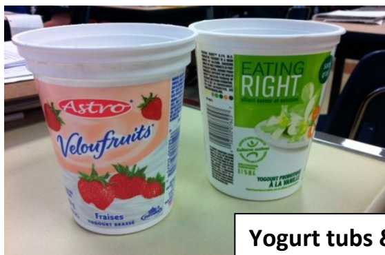
Yogurt tubs & cups—all sizes –WITH lids please.