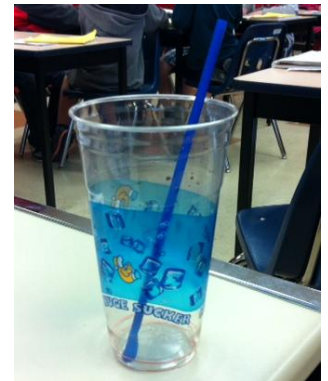
Slurpee cups—all sizes –no lids please.