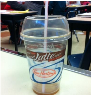
Ice cappe cups—all sizes –no lids please.

At ESOMS are always looking for opportunities to sustain our natural environment. The students and staff are conscious of things like reducing our paper consumption, and recycling paper /water bottles/lunch containers etc. The ART department needs containers; instead of purchasing them we would like your help in collecting items below (and see it as an awesome opportunity for people to “reuse” an item):